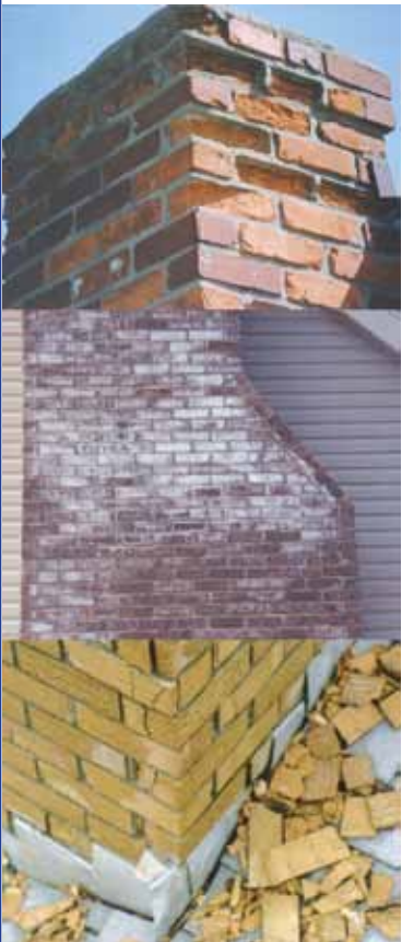
Severe spalling and deterioration is caused by water penetration.

Chimneys are highly exposed to the elements and, if left unprotected, are susceptible to structural deterioration. It is important to address this problem before serious damage occurs. A complete protection program should include a chimney cap and repair of any cracks or deterioration on the crown, mortar joints and flashing; in addition to an application of ChimneySaver Water Repellent to the entire chimney.